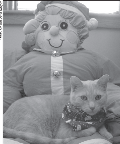
Mrs. Clause provided a comfortable lap in one communal cat room in December. Real-live laps are sought to help socialize cats who aren't able to enjoy the freedom of the communal rooms.