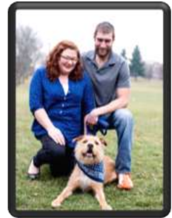
Lincoln with his forever family!

Our efforts to be the place where pet owners turn to when there are no other options, end pet homelessness, and instill respect, kindness, and compassion in our community can't be realized unless we have the support of everyone.